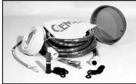
Contractor System Accessories

Field portable, high-production, single-chamber blast machine system, rated at 150 psi, for one operator. Holds 6 cubic feet of blast media. Equipped with Millennium pneumatic remote controls. Components listed on next page.