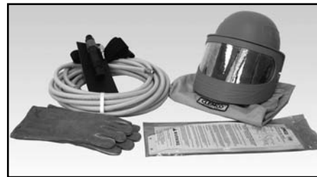
Operator Safety Equipment