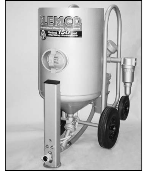
6 cu ft Contractor Blast Machine with CPF-20 Air Filter Installed